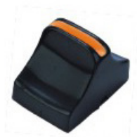
45016 Glossy finish with paint filled indicator line 亮面, 指示線劃漆 14(L) x 9.7(W) x 10.4(H) mm Shaft hole: 4.2 x 1.1 mm