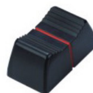
45019 Light texture with paint filled indicator line 淺咬花表面, 指示線劃漆 21(L) x 12.1(W) x 19.4(H) mm Shaft hole: 3.5 x 1.1 mm