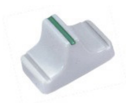
45018 With paint filled indicator line 指示線劃漆 16.2(L) x 10.1(W) x 8(H) mm Shaft hole: 3.8 x 1.6 mm