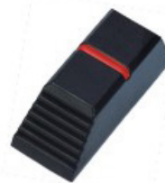
45015 With paint filled indicator line, knurling on two sides, glossy finish 亮面, 指示線劃漆, 兩側直齒狀 20.2(L) x 7.2(W) x 7.2(H) mm Shaft hole: 3.7 x 1.0 mm