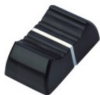
45012 With paint filled indicator line 指示線劃漆 25(L) x 15(W) x 9.6(H) mm Shaft hole: 3.5 x 1.1 mm